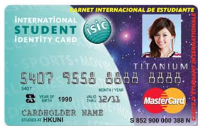
International Student Identity MasterCard

The card designs retain the large proportion of the original card face design as International Student Identity Card and International Teacher Identity Card. Cardholder's photo will be printed on the card face to symbolize the identity of international student and teacher.